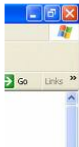
← Scroll bar

Scroll bar – a horizontal or vertical bar along the edge of a window used to bring different parts of a document into view