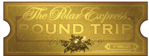
Kindergarten Polar Express