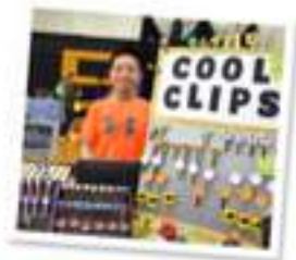
Creative: Acquire an innovativion mindset