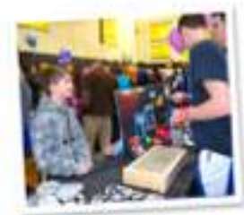
Hands-on: Learn through doing

The TREP$ Program teaches kids in grades 4-8 how to start their own businesses in 6-8 weeks. They learn the lessons in the 6 weekly workshops, and apply them at home as they build their business with the help of their families. The whole school community comes out to enjoy the TREP$ Marketplace, held right at the school, where the young entrepreneurs launch their businesses together. TREP$ can be offered as part of the curriculum or as after-school enrichment and can be taught by teachers or by volunteers in the school community.