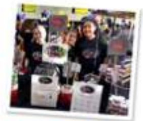
Empowering: Set goals and make decisions