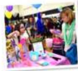
Real: Experience real business ownership